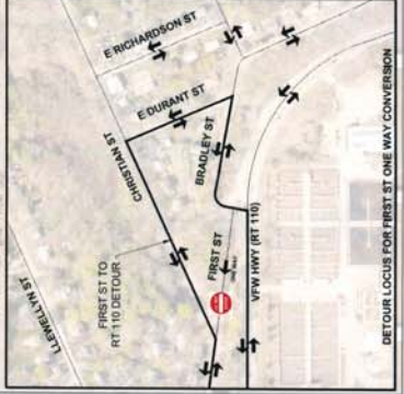
DETOUR LOCUS FOR FIRST ST ONE WAY CONVERSION

CITY OF LOWELL WASTE WATER TREATMENT PLANT