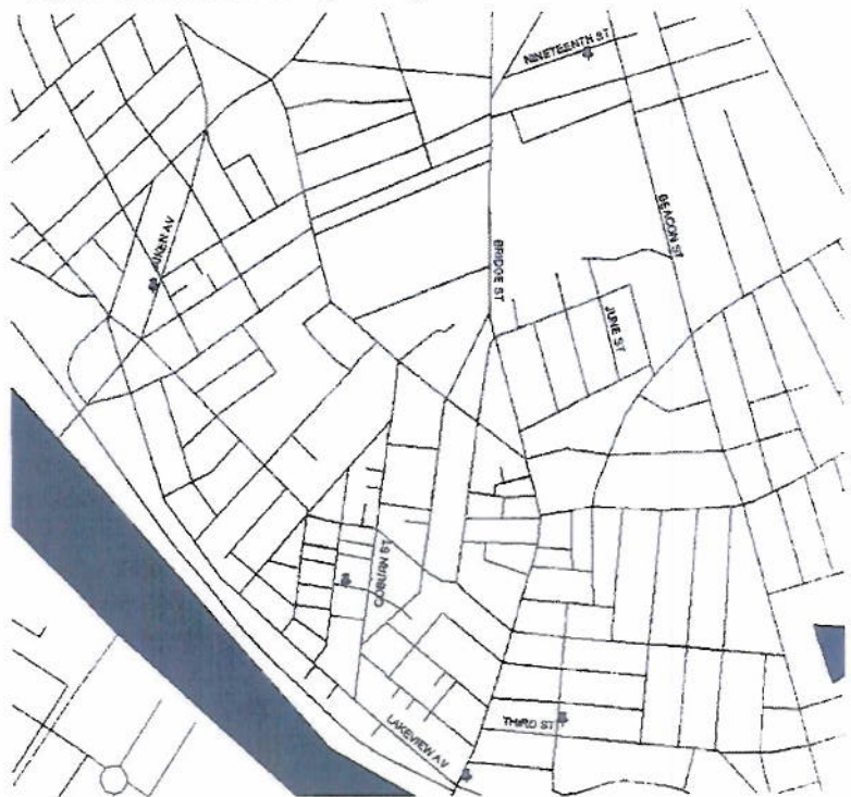
Figure 1: Centralville Gang Activity Locations