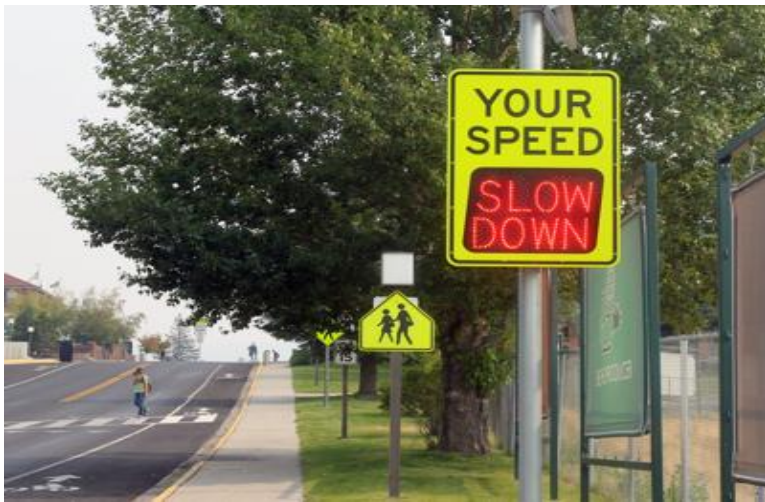
Dynamic Warning Sign