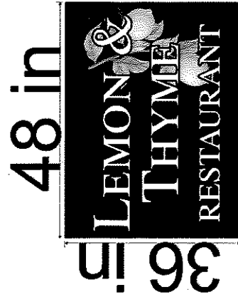
Holes in Bracket 62" On Center

All artwork is the property of Express Sign & Graphics and may not be reproduced without the consent of Express Sign & Graphics.