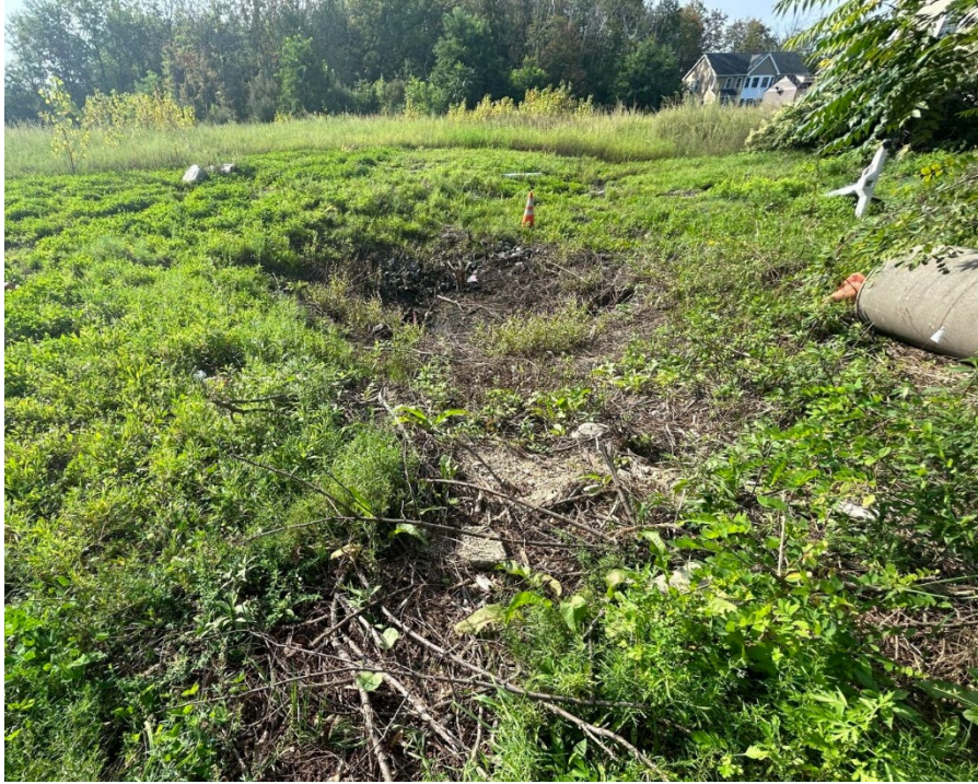
Figure 1. Existing Detention Pond