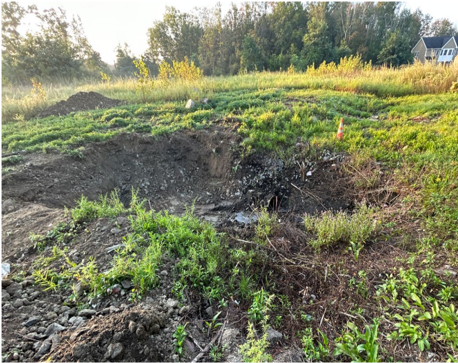
Figure 2: Detention Pond After Improvement