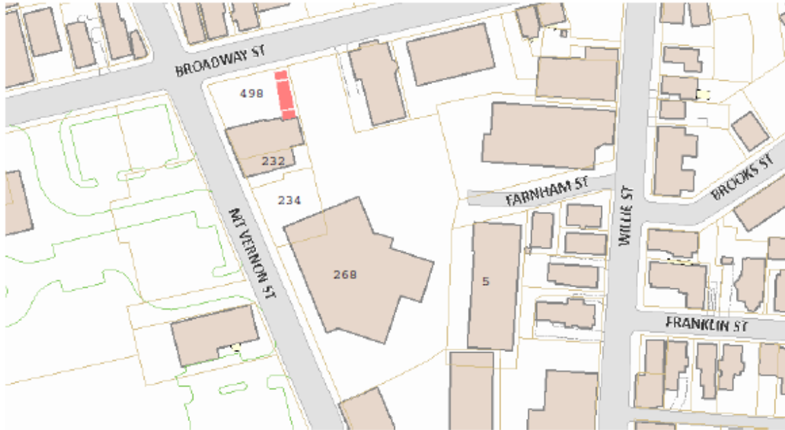
City Owned 234 Mount Vernon Street, 268 Mount Vernon Street, and 5 Farnham Street Privately owned (S&R Corporation) 232 Mount Vernon Street and 498 Broadway Street