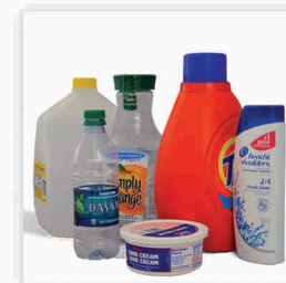
Kitchen, Laundry, Bath empty and replace cap