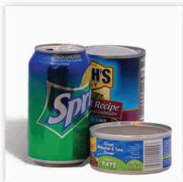
Aluminum and Tin Cans empty and rinse