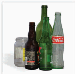
Bottles and Jars empty and rinse