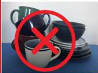
Ceramic Mugs and Dishes